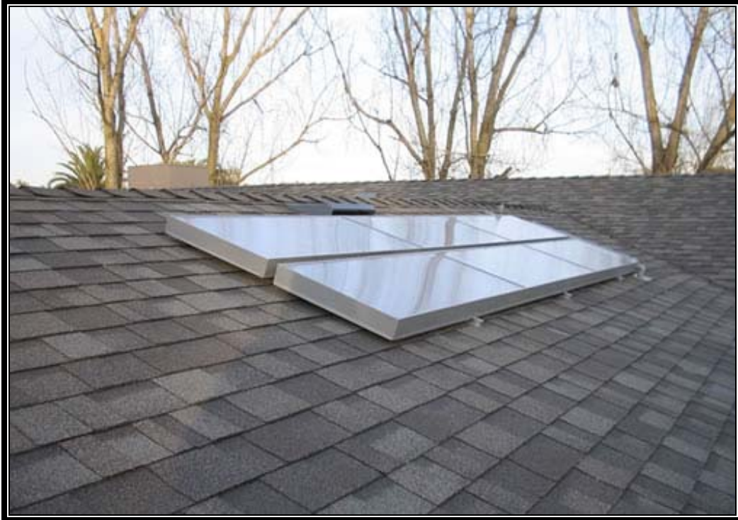
Roof Mounted Hot Water Collector (Rated 1.0KWh)