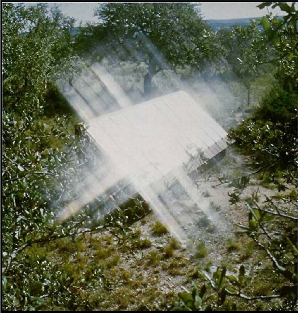
Flush Mounted Hot Water Collector (Rated 1.8KWh)